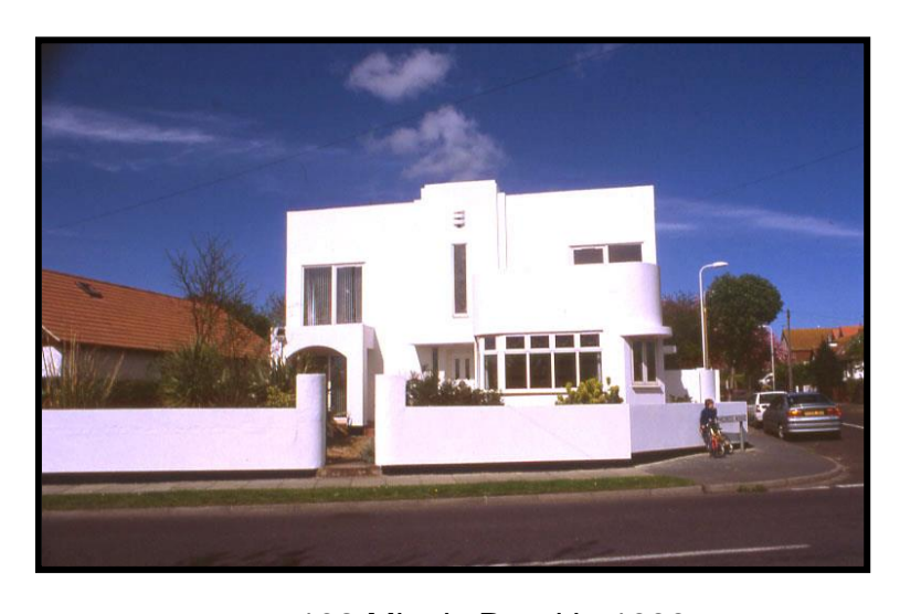
102 Minnis Road in 1999